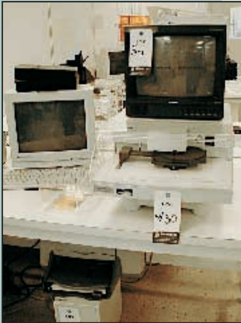
KLA/TENCOR ALPHAS STEP 500 PROFILOMETER