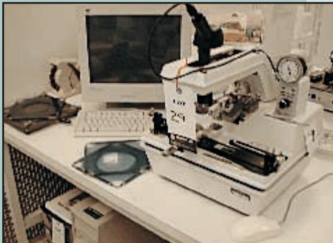
LOOMIS LSD-100 SCRIBER/BREAKER