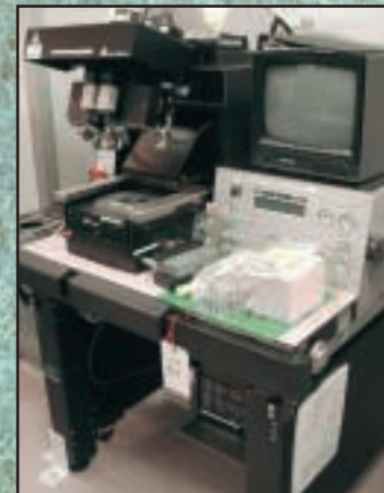
KARL SUSS MA6/BA6 BACK SLIDE ALIGNER