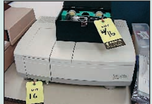
SHIMADZU UV-1601 UV SPECTROPHOTOMETER