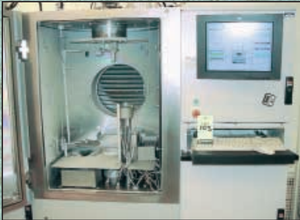
DENTON INFINITY FACET COATER

COMPLETE FACILITY LATE-MODEL LOW-USAGE R&D AND PRODUCTION TOOLS