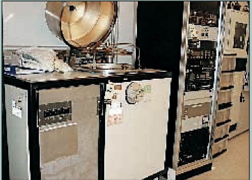
AIRCO TEMESCAL BJD 2400 E-GUN EVAPORATOR

THURSDAY, JANUARY 29 AT 10:00 A.M. (PST)