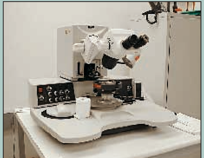
K&S 4523 WIRE BONDER