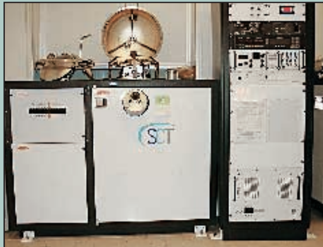
AIRCO TEMESCAL BJD-1800 E-GUN EVAPORATOR

THURSDAY, JANUARY 29 AT 10:00 A.M. (PST)