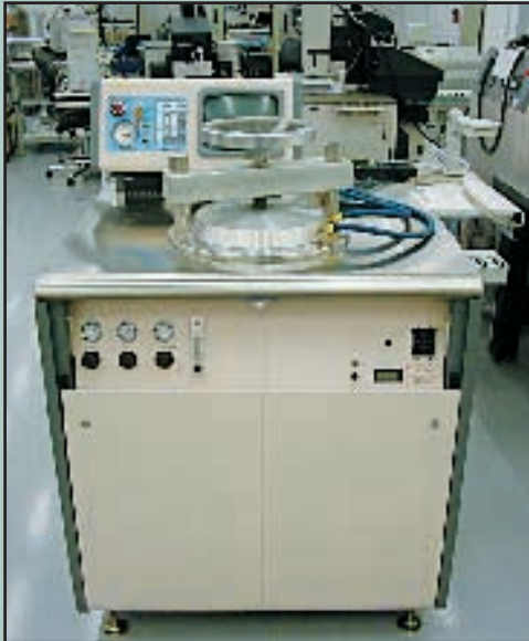
SST MV-2200-CE HERMETIC SEALER