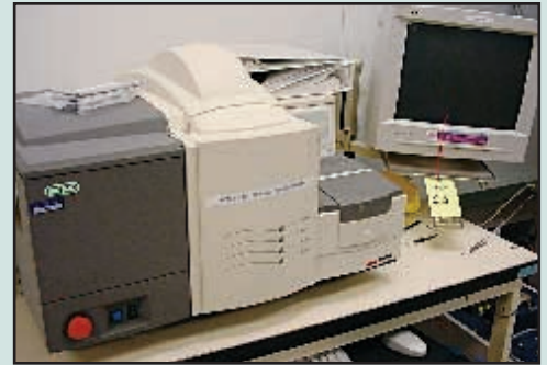
BIO RAD/ACCENT 2,000 RPM COMPOUND SEMICONDUCTOR PHOTO-LUMINESCENCE SYSTEM