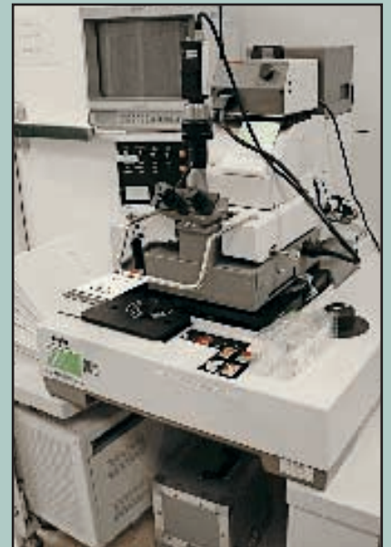
CANON PLA-501 MASK ALIGNER